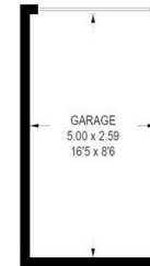
(NOT SHOWN IN ACTUAL LOCATION / ORIENTATION) OUTBUILDING

Illustration for identification purposes only, measurements are approximate, not to scale.